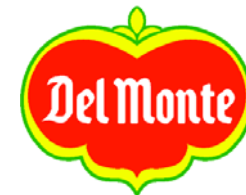
Del Monte 1