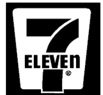
Seven Eleven 2