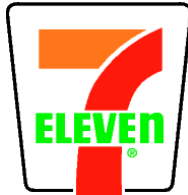
Seven Eleven 1