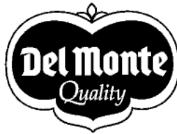
Del Monte 2