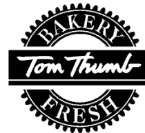
Tom Thumb Bakery 2