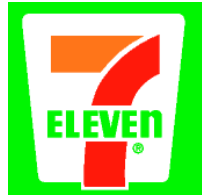
Seven Eleven 2