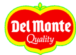
Del Monte 2