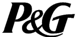
Proctor & Gamble