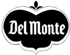
Del Monte 1