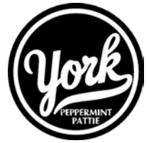
York Peppermint Pattie 1