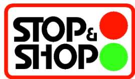
Stop & Shop Foods