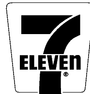
Seven Eleven 1