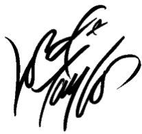
Lord & Taylor