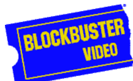
Blockbuster Video 2