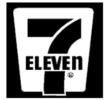
Seven Eleven 2