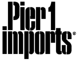
Pier 1 Imports 1