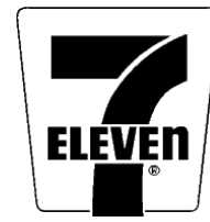
Seven Eleven 1