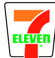
Seven Eleven 1