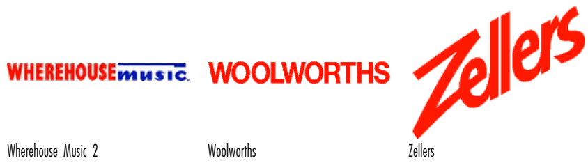
Wherehouse Music 2